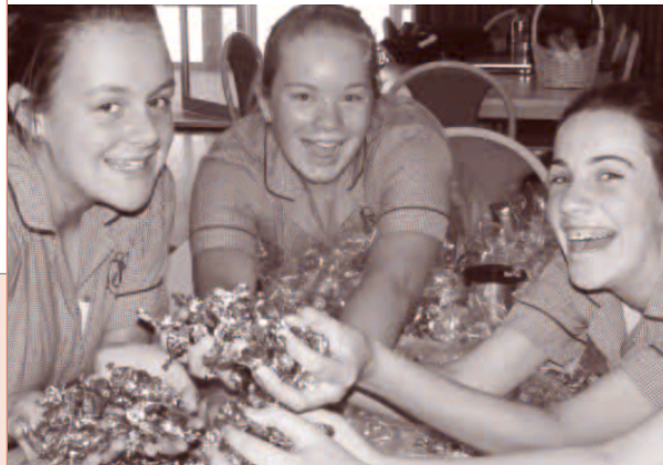
Pictured are three of the Annesley girls who happily volunteered to help pack sweets for the hampers.

Together we have shared the true spirit of peace, joy, love and hope of Christmas. ■